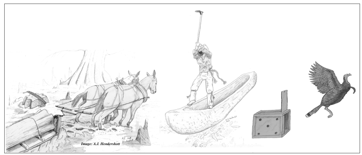
The logo from this year's MNRC theme.

MNRC 2020 has come and gone. This year's theme was Exploration, Exploitation, and Conservation: Comparing History and Current Management.