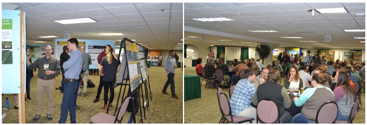
Conference attendees visit and view posters at the Mixer, which kicked off the conference Tuesday evening.

The Mixer started the conference off with a bang. Exhibitors and Poster presenters had a lot of traffic as people spent time visiting. I hope you took the time to visit with many of them.