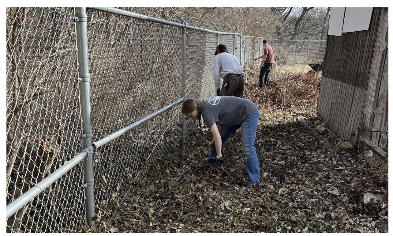
Members remove invasive species at the Raptor Rehabilitation Project facility.

To promote the clubs and for better outreach, the clubs have been posting to Instagram and have started a Facebook! If you are not following the student chapter Facebook/Instagram, follow @muforestryclub for Instagram and @MUforestryclub for Facebook.