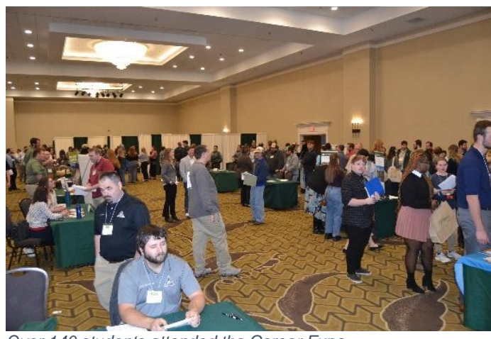
Over 140 students attended the Career Expo.

We also did a lot of mentoring. It started with the Career Expo where those looking for a job, advice on how to be in an interview, review of their resume, or how to apply for a federal job, were provided with these opportunities. It was an overwhelming success with approximately 140 students attending this event alone. The Wednesday luncheon was also a great success. MNRC hosted 125 students for a free lunch. All they needed to do was be