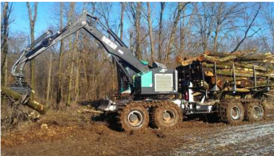
The TimberPro TF830 Forwarder was featured at the mechanized logging demonstration along with the TimberPro 735 Harvester.