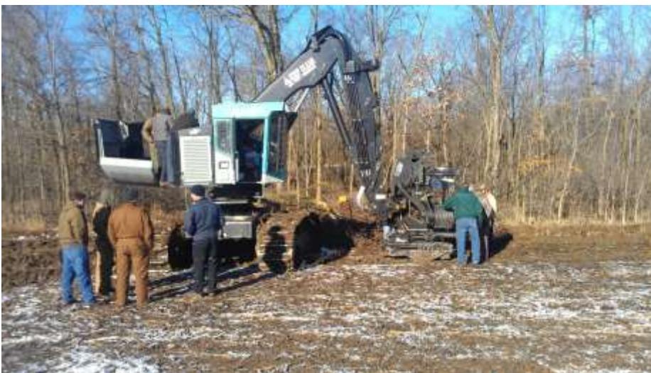
Area loggers, foresters and industry professionals get a close look at the TimberPRO 735 Harvester during the mechanized logging demonstration.