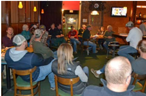
MOSAF members listen intently