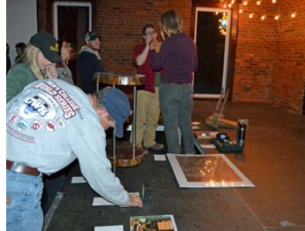
Iowa's silent auction